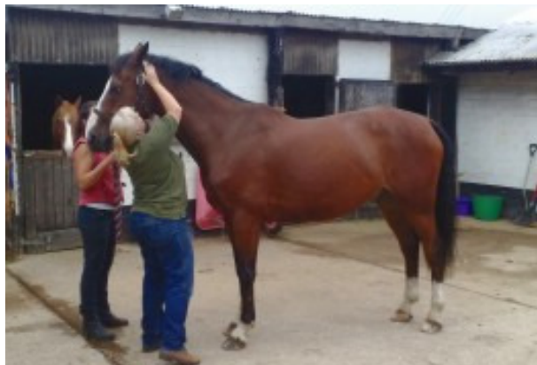
1. Holistic Treatment - from Head...

Nowadays, organic healthcare is increasingly popular. Avoiding herbicides, insecticides, antibiotics and other pesticides is a key issue, but actively choosing herbal remedies is another part. Beyond that, there are more opportunities with natural therapies.